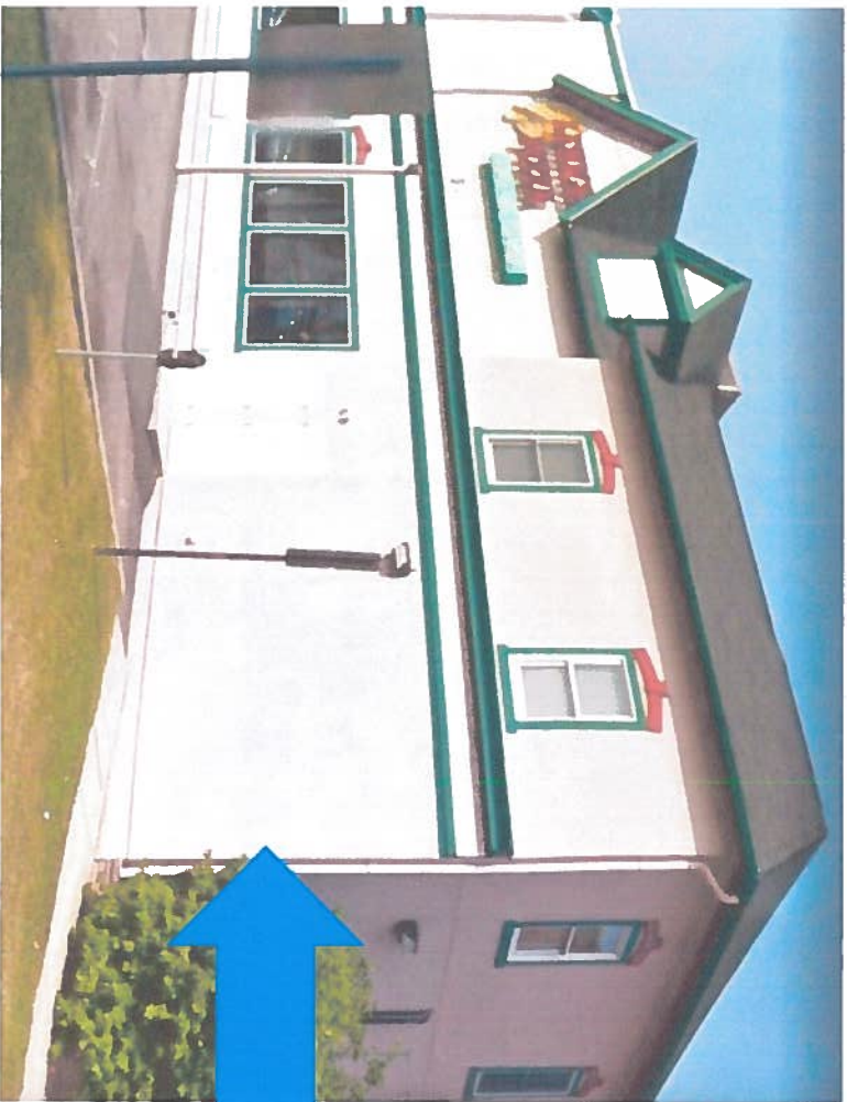
Lehigh Pizza 13 W 3rd St, Bethlehem, PA 18015